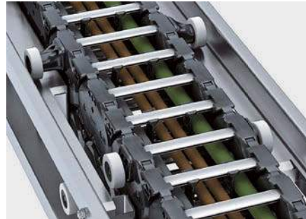
Easy maintenance – rollers can be replaced without having to replace the side bands

The rollers run on the guide rail and do not knock against other rollers. Ball bearings and a plastic roller surface support quiet, smooth operation.